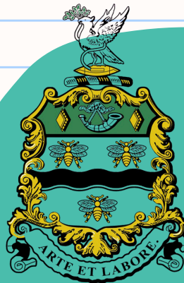
SKILL & LABOUR